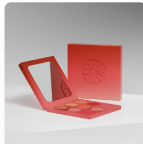
Glamorous Nudes Eyeshadow Palette $35.00 USD