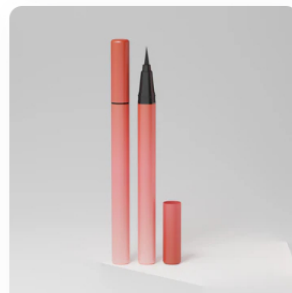
Midnight Magic Liquid Eyeliner $21.00 USD