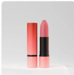
Crystal Sheen Lipstick $25.00 USD