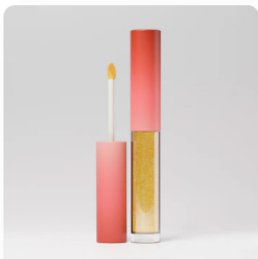
Glitz & Glitter Liquid Eyeshadow $25.00 USD