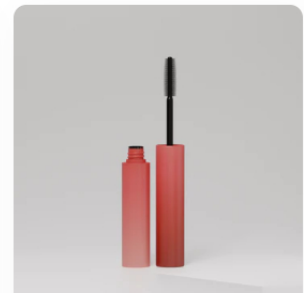
Glitz & Glam Waterproof Mascara $22.00 USD