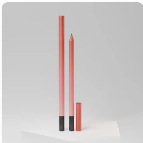
Chic Contour Lip Pencil $20.00 USD