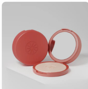
Hollywood Highlight Pressed Highlighter $34.00 USD