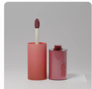
Rosé All Day Liquid Blush $30.00 USD